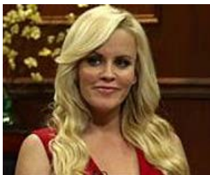
Jenny McCarthy Bares All Ora.TV