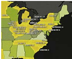
If You Ever Want to Retire Look at This Chart Money Morning