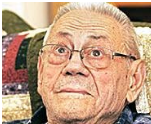
14 Benefits Most Seniors Didn't Know They Had Newsmax